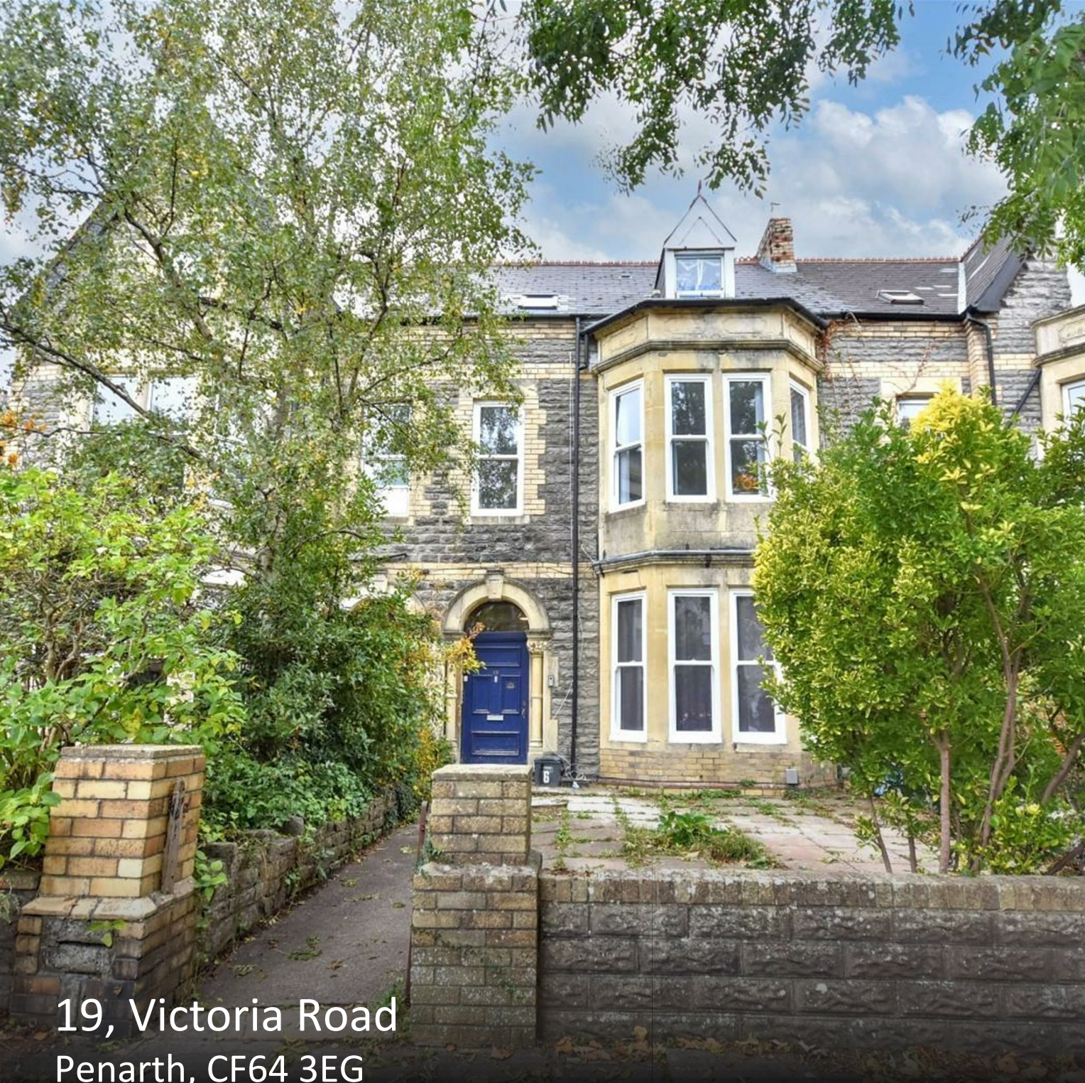
19, Victoria Road Penarth, CF64 3EG